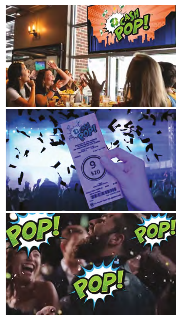
The New Jersey Lottery's "How to Play" video for Cash Pop captures the fun, easy-to-play spirit of the game.

Using all these dimensions, players can design the game that they like – this was the key element. And, in all three jurisdictions